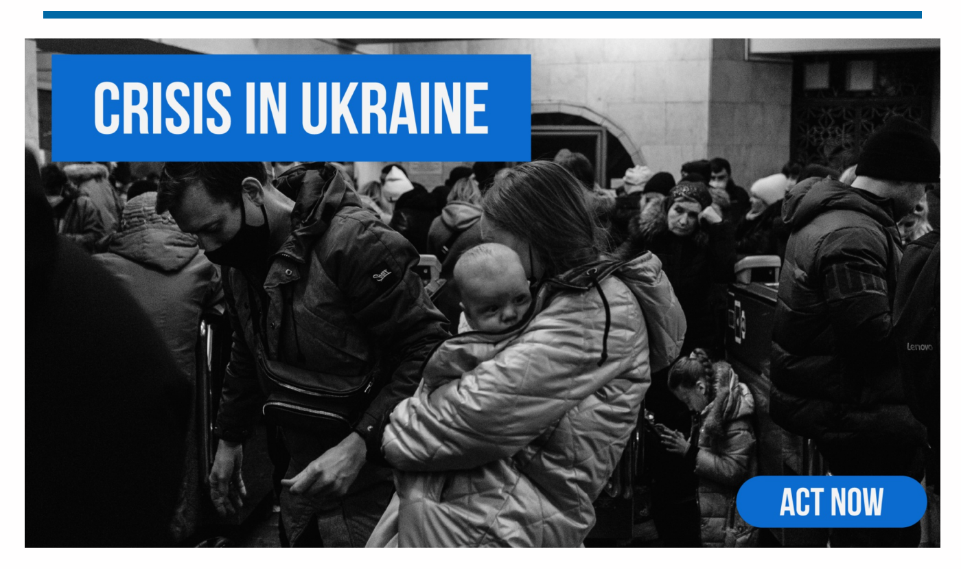
Without the generosity of people like you, the support we've been able to provide and continue to provide would