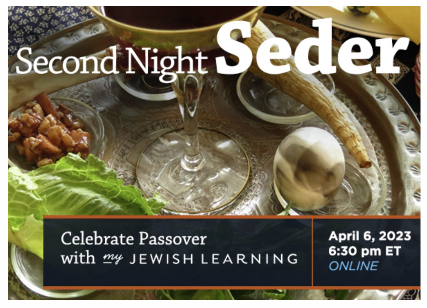
A Night to Remember: An Online Passover Seder