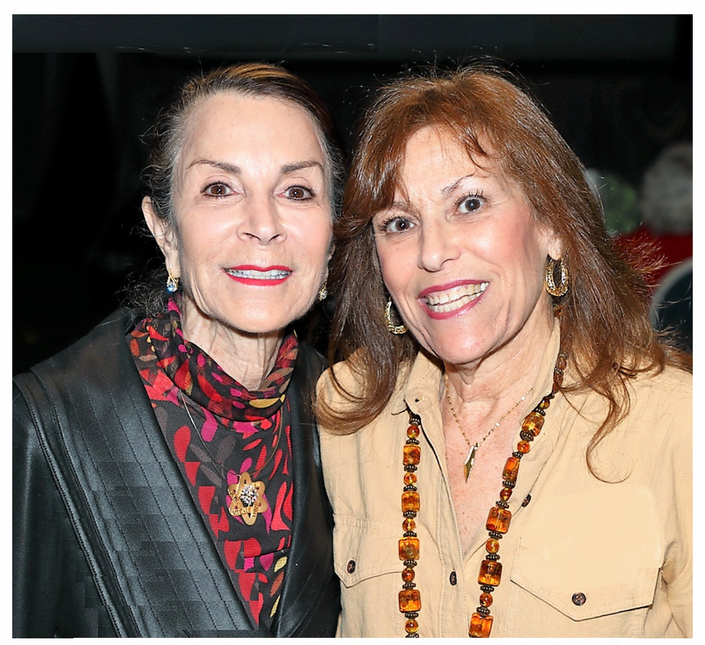
THANK YOU TO OUR FIRST SPONSORS FOR ISRAEL 75

Israel 75 is free of charge to attend but bring your shekels for the wonderful Kosher food and other items for sale. Your spirit is needed to send our birthday greetings to Israel on the occasion of their 75th year as a free Jewish Nation. Please help us and encourage your family and friends to join you on Sunday, April 30, at Palm Valley School, 35-525 Da Vall Drive, Rancho Mirage, CA, 92270, from 10:00-2:00.