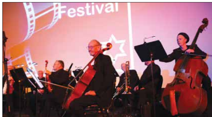
Musicians from LA Jewish Orchestra playing "Symphony of the Holocaust"