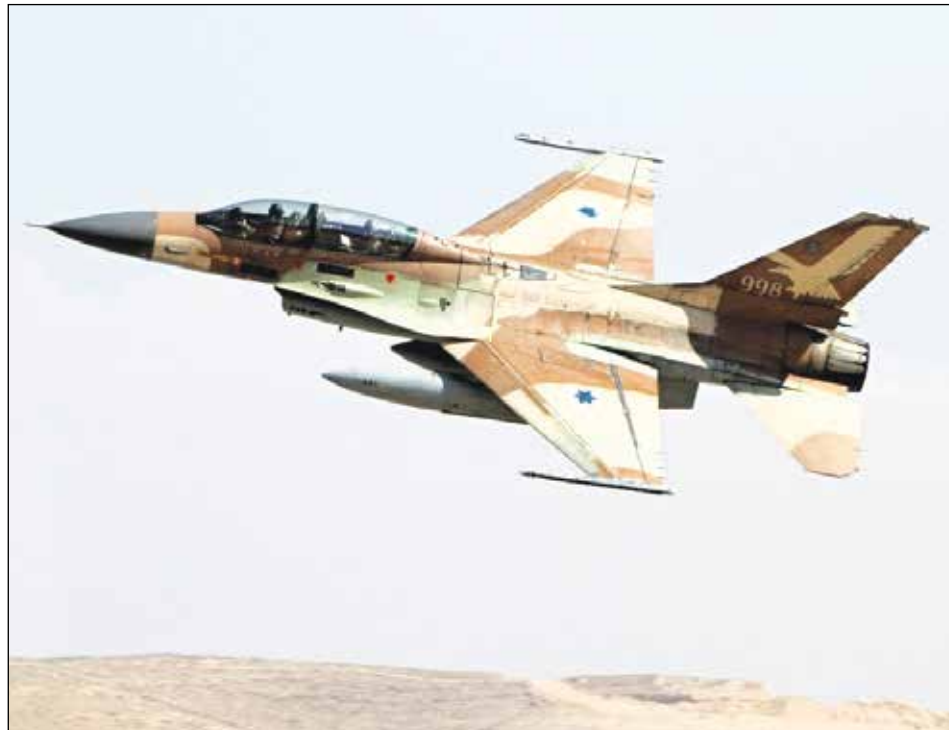
Israeli fighter jet

This is still an overall reduction in ranking over the decade, as Israel had been in 11th place 10 years ago, during which time Iran rose rapidly despite the sanctions imposed on it.