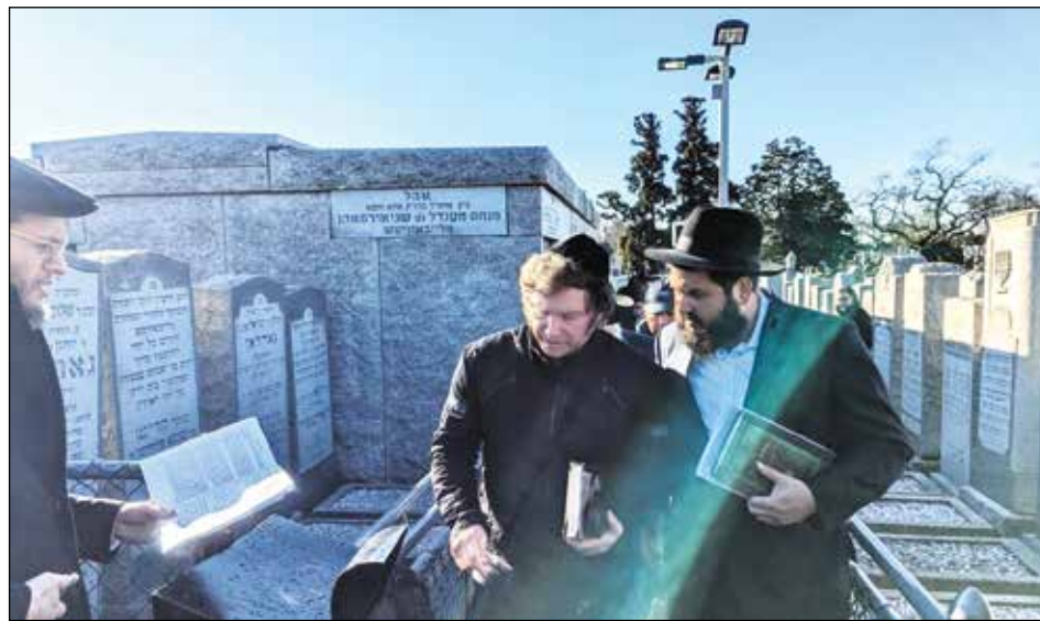
Javier Milei, Argentina's President-Elect, visits the grave of the Lubavitcher Rabbi in Queens, New York, November 27, 2023.

"I am going to be thankful because when I last visited this place, I asked