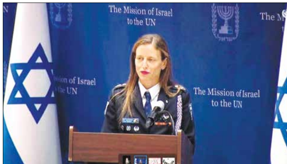
Israeli Police Chief Superintendent Yael Reichert

I have stated the following on numerous occasions, and I reiterate: Israel has committed a serious error in judgment by not holding an official open-door media event for the foreign press aimed at publicly displaying and exposing the vile acts perpetrated by Hamas. Since the onset of the war, over 1,000 foreign correspondents have arrived in Israel to cover the aftermath of the October 7th attack and the events that followed. The fact that these journalists traveled far and wide should have been utilized by Israel's government to garner widespread support for its operation. This support is critical. The foreign journalists should have been invited to a massive public press event hosted by an official Israeli agency that their networks would surely broadcast live. They should have heard and seen firsthand, by Israeli officials and survivors, what happened here on Oct. 7th. They should have been provided with all the evidence in Israel's possession – the official, undeniable, horrifying documentation of the brutalities that occurred – and they should have published this evidence as part of their coverage of the war.