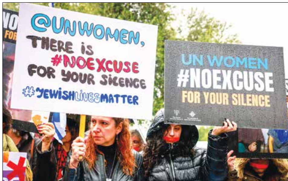
Israeli women protest outside UN headquarters in Jerusalem November 27, 2023

Nearly 50 days after Hamas' attack on Israel left 1,200 dead, and after weeks of criticism over its silence about allegations of sexual violence during the attack, the women's rights group UN Women issued a statement condemning the terror group on Friday.