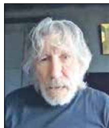
British musician Roger Waters

"The Israelis seem now to have a policy of murdering so many of them, that they are absolutely trying to create another intifada, so they can make