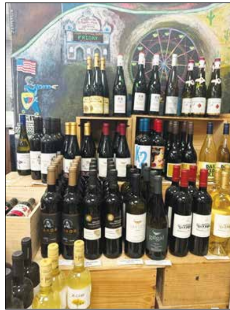
Kosher red and white wines Selection

fascinating and of course, the history behind Kosher wine is unique. The production of Kosher wine requires a lot of attention and it's manually intensive. It's basically handcrafted and organic. Few wines go through such thorough and “personalized” process. Wines are very romantic; you can taste the earthiness and the personality of its origin. Wines are also alive; you can feel the aromaticity depending on its age. So, imagine all this plus a millenary tradition!