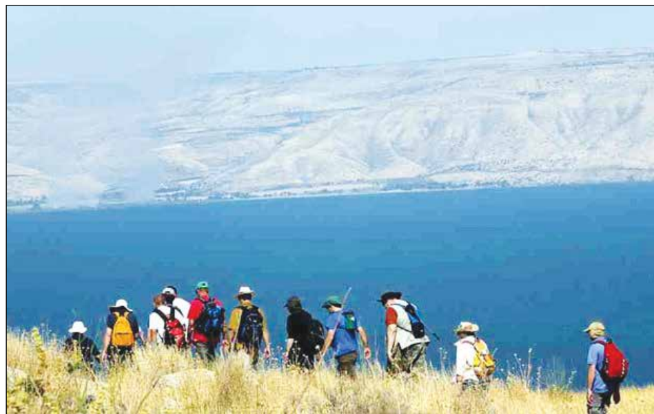
Hikers near the Sea of Galilee, Israel's largest freshwater lake