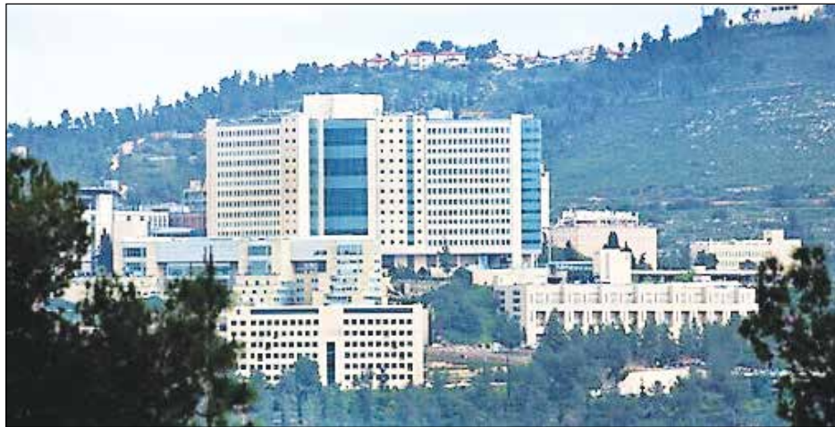
Hadassah-Ein Kerem Hospital in Jerusalem

Newsweek has named Jerusalem's Hadassah Medical Center a world leader in oncology, and for the fifth straight year one of the globe's top hospitals in both cardiology and smart technology.