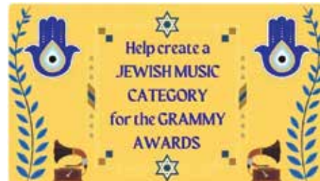
Petition placed by Joanie Leeds

about their proposal, they have launched a petition on the Change.org website. By the end of the week it had more than 1,800 signatures, including from non-Jewish musicians.