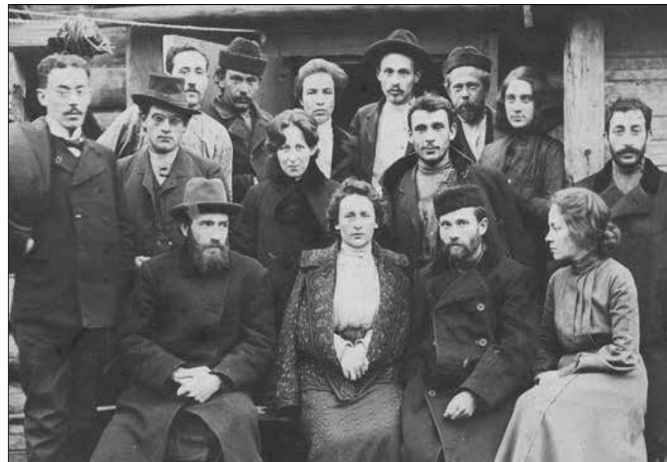
Political exiles in Siberia, 1904, from the Jewish Labor and Political Archives.

journey of the archives' materials, which were seized by the Nazis but were later rediscovered in France after the German army's retreat. In