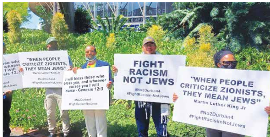
A South African Friends of Israel demonstration in Durban.

It added: "And to maintain their grip on power, they have instituted apartheid to control and manage Palestinians. As South Africans, we refuse to stand by while apartheid is