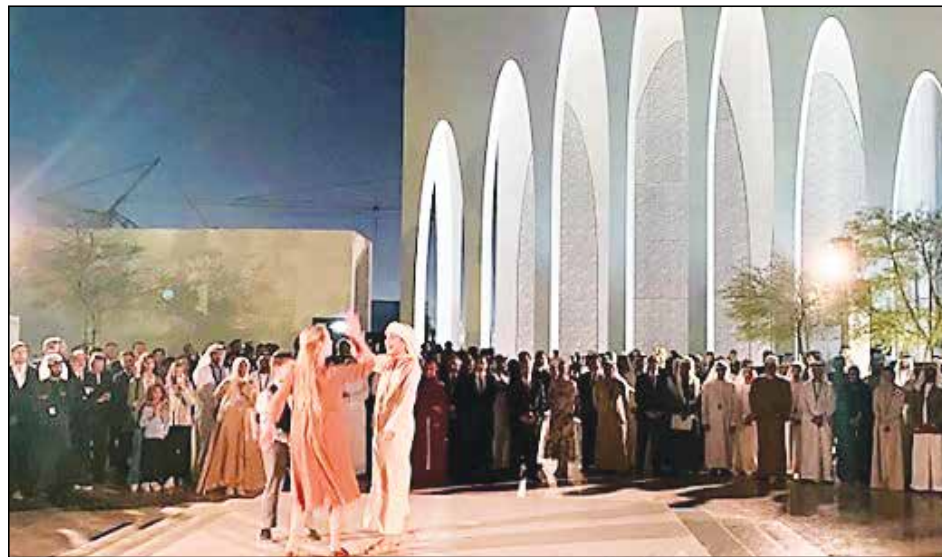
Opening ceremony of the Abrahamic Family House, Abu Dhabi, 16 February 2023

"The UAE has a proud history of people from diverse communities working together to create new possibilities," Sheikh Mohammed said on Twitter. "As the [Abrahamic Family House] in Abu Dhabi is inaugurated,