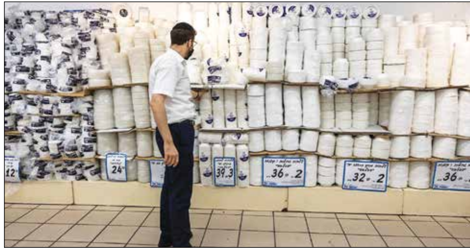
A man shops for disposable plastic tableware in Osher Ad Supermarket in Givat Shaul, Jerusalem.

Israel is either the world's top or second-biggest consumer of disposable tableware per capita, depending on the analysis, making the goods a natural target for environmental activists. And the taxes were projected to bring in $350 million annually to the country's treasury, no small amount. That's nearly twice, for example, what