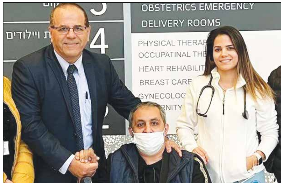
UAE Sheikh Khalid Qasmi treated at Emek Medical Center, Afula

"This is a special expression of what we all mean when we say 'peace agreements,'" said Sheikh Qasmi, "It is an expression of pure humanity and I have no choice but to express my appreciation to the people of Israel and wish for continued