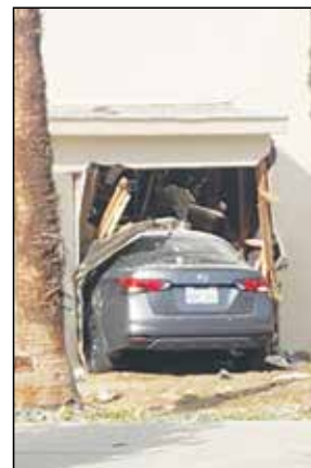
Car crashing into shul

Despite this disruption our community is resilient, and we will use this event to grow stronger. We have faced vandalism and other challenges in the past, and always moved forward with a sense of resolve and purpose; we will rebuild from this too. At Chabad of Palm Springs, we strive to create a flourishing space for you to connect with your Judaism and with other Jews throughout the Coachella Valley, and that will never