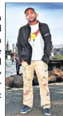
The mural of Tibor Baranski, who saved more than 3,000 Jews during the Holocaust

Since its foundation in 2009, Artists 4 Israel's principal mission has been to bring diverse groups of graffiti, street and mural artists to Israel to create projects