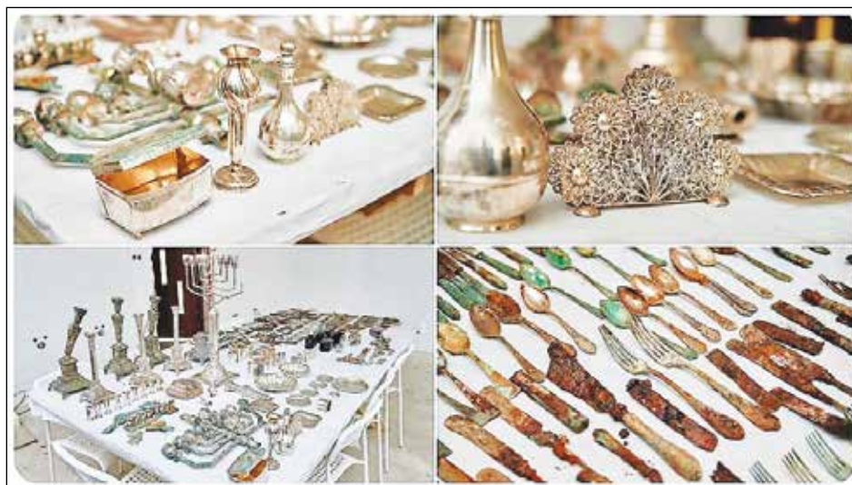
Some of artifacts found

Poland's major industrial centers, was one of the largest Jewish communities in Europe, numbering over 230,000 or 31% of the city. Almost all of them were killed by the Nazis during their occupation of the city from 1939 to 1945.