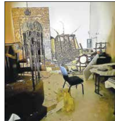
Despite extensive damage to the sanctuary, the Ark and torahs missed being hit by inches