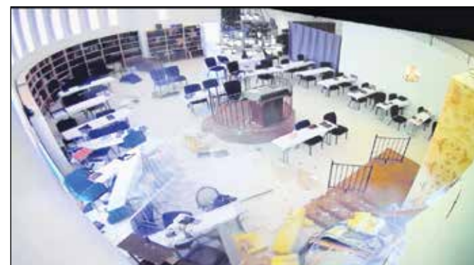
Security cameras record moment car crashes into shul