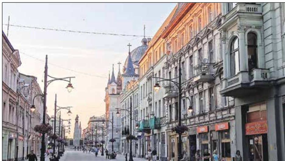
Piotrkowska Street In Lodz, near where the Jewish artifacts were found