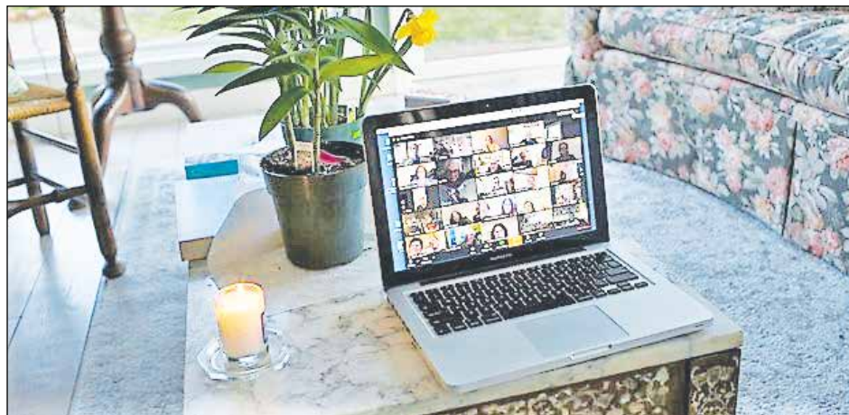
Photo of a family's Zoom shiva service from the premises.