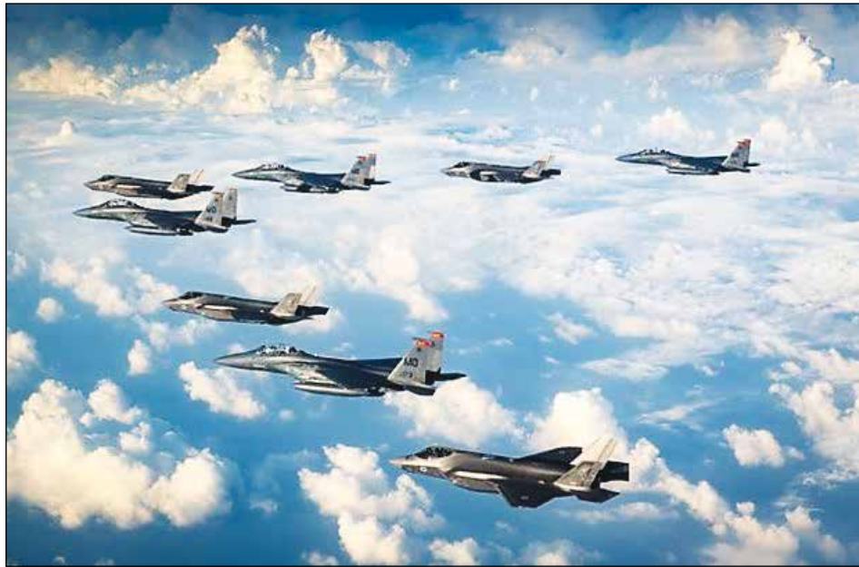
Israeli F-35i and American F-15 jets hold an exercise over Israel, November 29, 2022

Israel has become a pivotal player for the United States in recent months as regards threats posed to the Middle East and Persian Gulf by Iran. And more so since the discovery of Iranian drones with American parts in the Russian arsenal. Following a months-long series of joint exercises and meetings, the U.S. sent six fighter jets to an Israeli military base to conduct joint drills simulating strikes