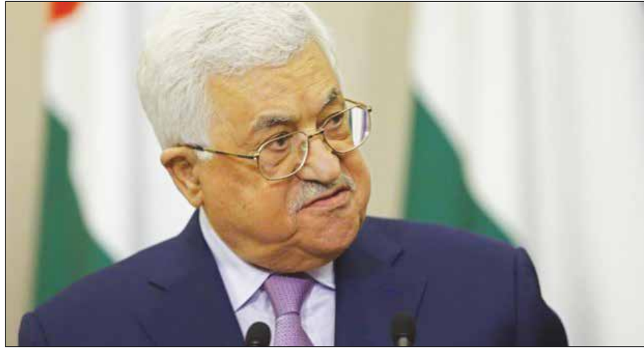
Palestinian President Mahmoud Abbas