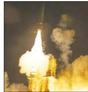
Israel's Arrow 3 Interceptor

Should there be a missile threat, an interceptor missile would be launched