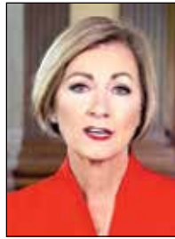
Iowa Governor Kim Reynolds

The bills fall into two separate but related trends of legislation. The IHRA's 2016 working definition of antisemitism, while controversial for including certain criticisms of Israel, has also been adopted by more than 800 entities worldwide, including 200 just last year, according to a recent study by the Combat Antisemitism Movement and Tel Aviv University.