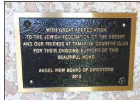
Plaque acknowledging Jewish Federation and Tamarisk CC throughout the Coachella Valley. The program has been so successful, it's been expanded three times.