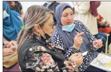
Lissan's women-only Hebrew classes make it comfortable and appropriate for all participants.

"This is a very, very good course for me. I'm enjoying it and having