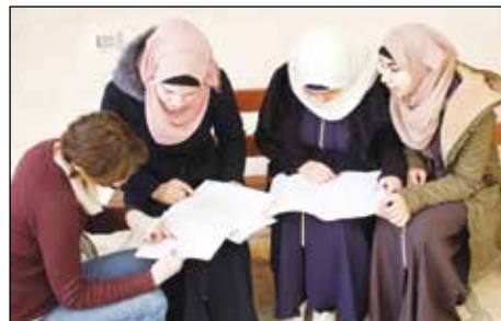
Lissan Hebrew classes start at beginners' level and are geared toward employment.

fun with the teachers, playing with learning, learning some songs – children's songs, but [it makes] you feel young," she laughs. "I say that no matter how old you are, you need to keep on with life and have to carry on. If not for you then for your children. If you educate your children, you open a window for them. Without the language you can't get around. It's very difficult."