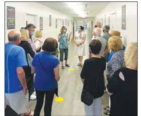
Tour of facilities