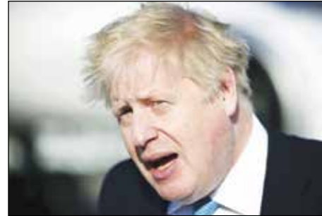
British Prime Minister Boris Johnson

The British MP called on Johnson to do "everything in his power to