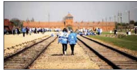
Participants at March of the Living walk the train tracks leading to Auschwitz-Birkenau Death Camp.