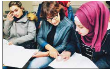
There are some 400 students enrolled in Lissan classes, taught by 40 volunteer teachers.