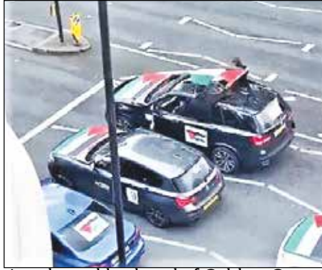
Jewish neighborhood of Golders Green.

Jewish News reported at the time that the cars were heading toward the heavily