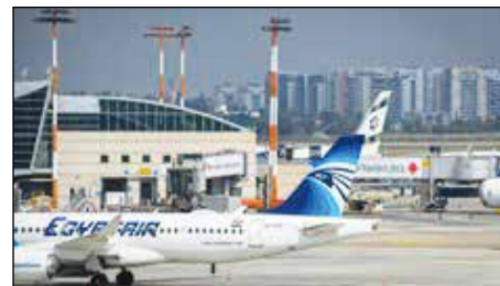
Egyptair Airbus 320 lands for the first time in a commercial flight, at the Ben-Gurion Airport October 3, 2021.

On the flip side, Mazel said that "after 42 years of peace, at the same time, it's a little bit sad that it took so long for an