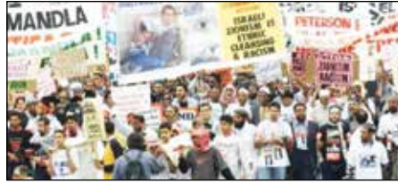
Anti-Israel protesters march through the streets during the World Conference Against Racism in Durban, Aug. 31, 2001.

with good cause. Honorable men and women will not dignify this anti-Semitic event with their presence," the Israeli Foreign Ministry stated September 22.