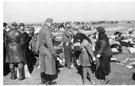
Aftermath of the Babi Yar massacre in Kiev, Ukraine, September 29-30, 1941, when 33,771 Jews were murdered in two days.

"The Jewish people have a long and complicated history, interwoven with Ukraine," Herzog said at the center's inauguration. In Ukraine "there flourished one of the greatest and most important Jewish communities