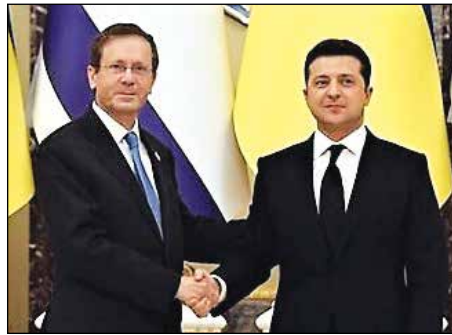
President Isaac Herzog (left) and his Ukrainian counterpart Volodymyr Zelensky shake hands in Kyiv, Ukraine, October 5, 2021.

"The time for memory has come," said Ukrainian President Volodymyr