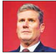
British Labour Leader Keir Starmer

The change to the complaint review process, which Starmer vowed to implement in his 2020 victory speech,