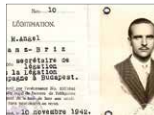
Ángel Sanz Briz's diplomatic ID, issued in 1942

But even though his efforts saved five times as many Jews as those of Oskar Schindler, his story is far less well known