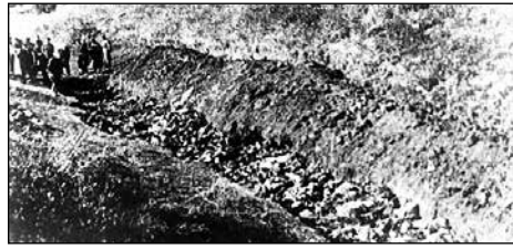
The Babi Yar massacre of the Jews of Kyiv, Ukraine, September 1941

is the Ukrainian ravine where on Yom Kippur eve in late September of 1941, more than 33,000 Jewish men, women and children were shot dead during just two days by the Nazis.