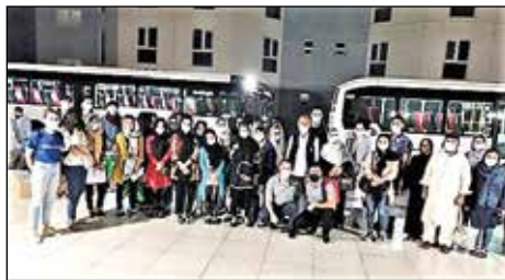
Asylum seekers from Afghanistan arrive in Abu Dhabi