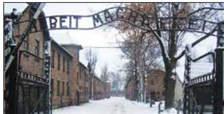
Main gate of Auschwitz-Birkenau

handwriting of the slogans would be analyzed, and that police have opened an investigation into the vandalism, with available video material now being examined.