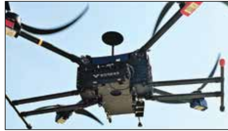
Drone given situational awareness

or 3D companies that analyze the world in 3D."