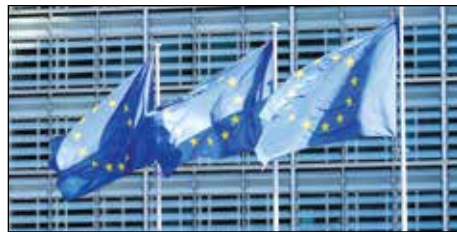
European Union flags flying above headquarters in Brussels

This includes the recommendation for adopting the International Holocaust Remembrance Alliance's definition of antisemitism across the 27-state bloc. Published in 2016, it lists classic examples of antisemitic behavior along with demonization of Israel and denial of the Jewish people's right to