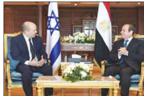
Israeli Prime Minister Naftali Bennett meets with Egyptian President Abdel Fattah El-Sisi in Sharm el-Sheikh, Egypt, on September 13, 2021.

Jerusalem Center for Public Affairs, told JNS, "If this flight signals the warming of relations and is the opening of a new phase in normalization between the countries, then yes, absolutely, I am happy."