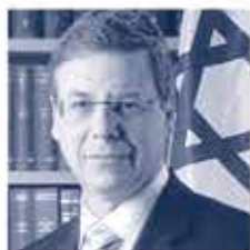
Ambassador Danny Ayalon Israeli Diplomat