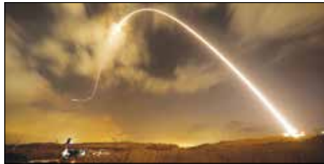
An Iron Dome battery fires an interceptor