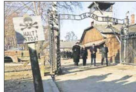
German Chancellor Angela Merkel visit to Auschwitz-Birkenau with Polish Prime Minister Mateusz Morawiecki and World Jewish Congress President Ronald S. Lauder.

Semitism and against all forms of hate" is crucial to her government, and added, "Remembering the crimes ... is a responsibility which