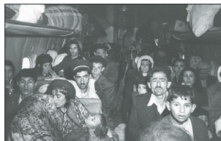
Plane filled with Iraqi Jews arrive at Lod Airport in early 1951

Israel and the United States, however, have lambasted UNRWA as anti-Israel and badly run, accusing it of perpetuating the conflict by not resettling refugees in other countries and recognizing all descendants of refugees as refugees, causing their