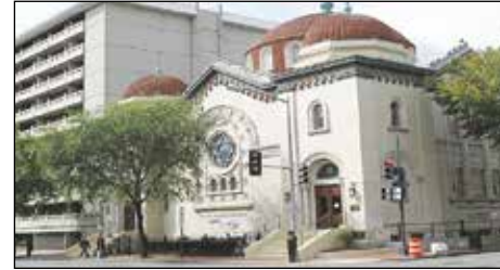
Sixth & I Synagogue in Washington, DC

synagogue's three rabbis said the damage was minimal and would be