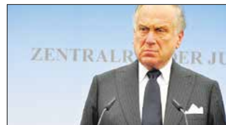
World Jewish Congress President Ronald S. Lauder

"Anti-Semitism has become fashionable again and for too long, American Jews have been silent. It's time to make our voices heard. It's time to confront our haters, without fear or apology," said Lauder in a statement. "ASAP will finally add real teeth in the fight against anti-Semitism in American politics and culture. All candidates and American cultural leaders who traffic in hatred against Jews should