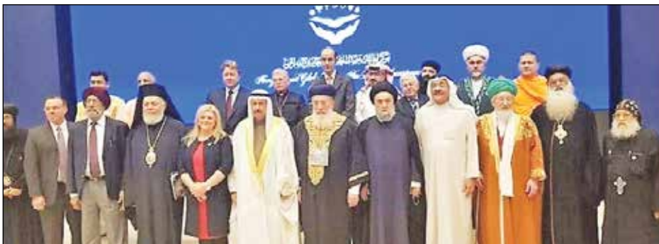
Sephardic Chief Rabbi of Jerusalem Shlomo Amar (front, center)

Chief Rabbi of Jerusalem Shlomo Amar, who previously served as the Sephardic chief rabbi of Israel, met Bahraini King Hamad bin Isa Al Khalifa on December 9, during a rare visit to the Persian Gulf state.