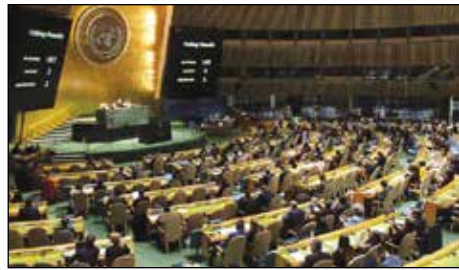
UN General Assembly

The resolution — co-sponsored by Comoros, Cuba, Indonesia, Jordan, Kuwait, Lao People's Democratic Republic, Qatar, Saudi Arabia, Senegal, United Arab Emirates and Yemen — still passed with a comfortable majority, with 87 "yes" votes, 54 "no" votes and 23