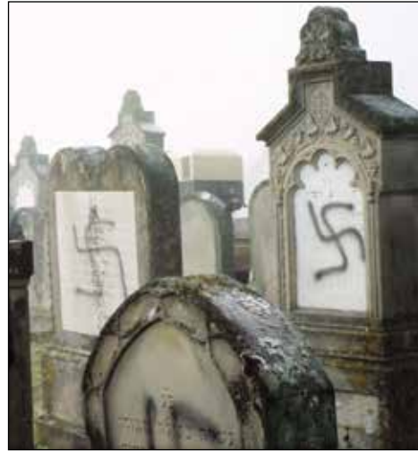
Defaced graves in Alsace Region

Both sites use the US-based internet infrastructure company Cloudflare. According to CNN , Cloudflare discontinued its service to 8chan in the summer following the discovery that a user thought to be the shooter in the El Paso mass shooting posted a rant on it. Cloudflare also said that following